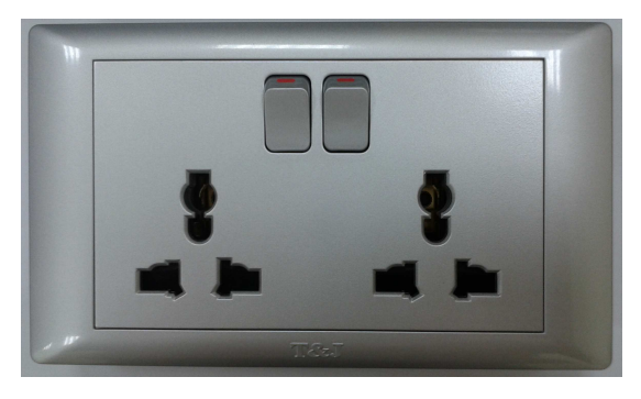
Front View of HB818SD